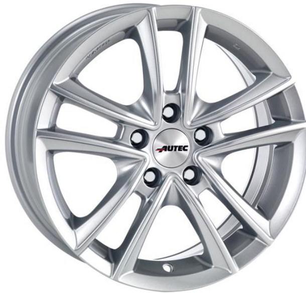
Type Y – Yucon Titanium silver