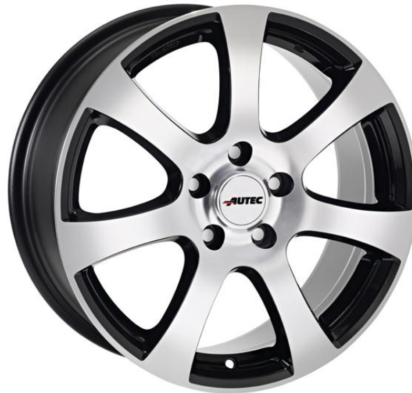
Typ Zp – Zenit polished Black polished