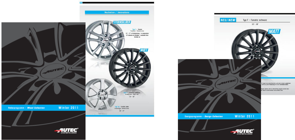
Wheel Collection Winter 2011