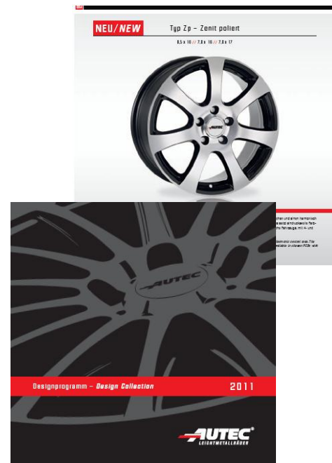
Design Collection 2011